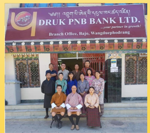
Staff Members of Wangdue Branch