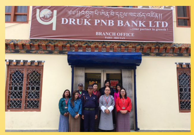
Staff members of Paro Branch